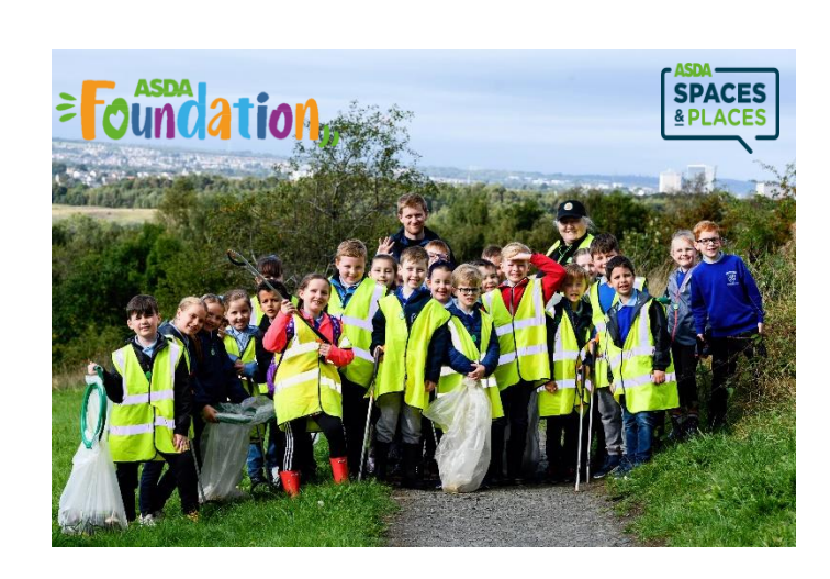
Community Champions supporting local organisations with hands on support and providing Asda Foundation grants that support local community spaces