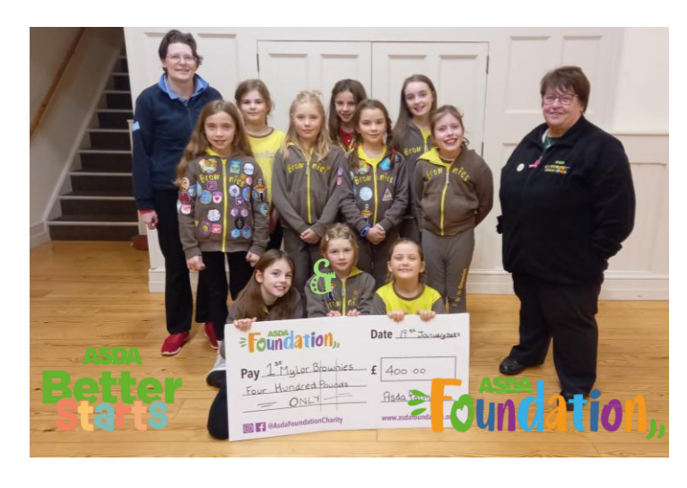
Providing grants that support grass root organisations