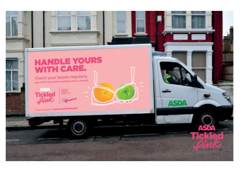
Providing new and innovative ways to share breast check education resources