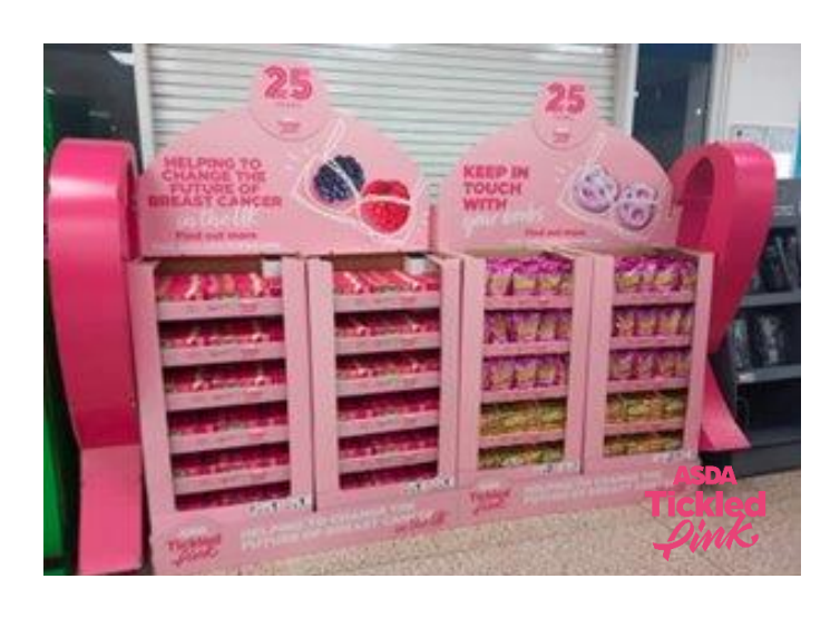
Enabling all colleagues to support through fundraising challenges, supplier CRM opportunities or education events