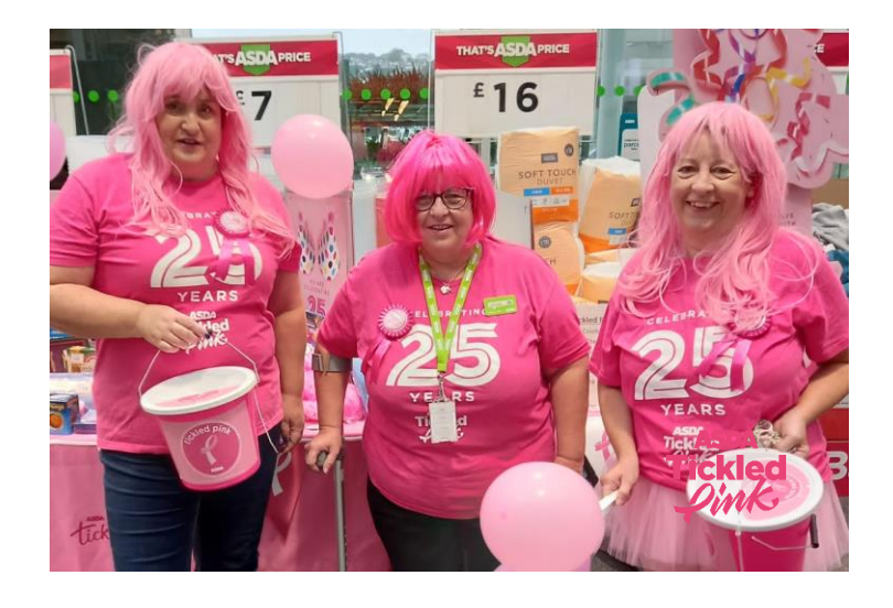
Funding the expansion and measurement of breast check awareness in the UK and opportunities to raise vital funds