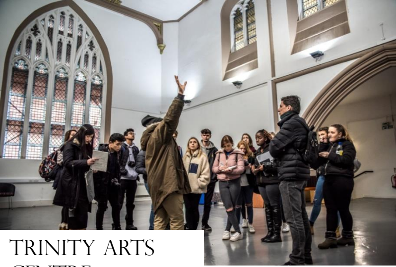
TRINITY ARTS CENTRE