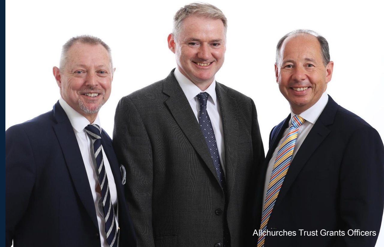
Allchurches Trust Grants Officers

OWNERS OF ECCLESIASTICAL INSURANCE GROUP