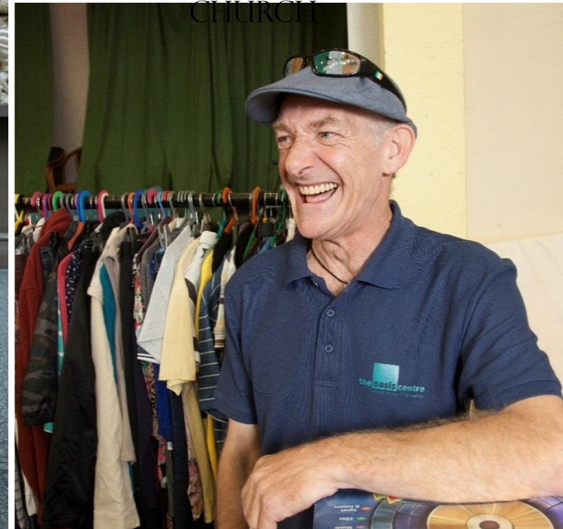
THE OASIS CENTRE,