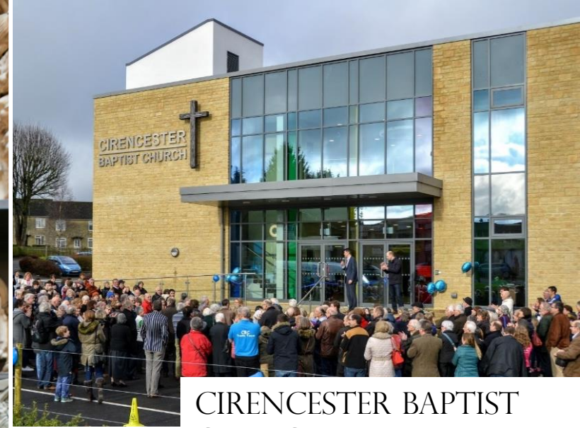
CIRENCESTER BAPTIST CHURCH