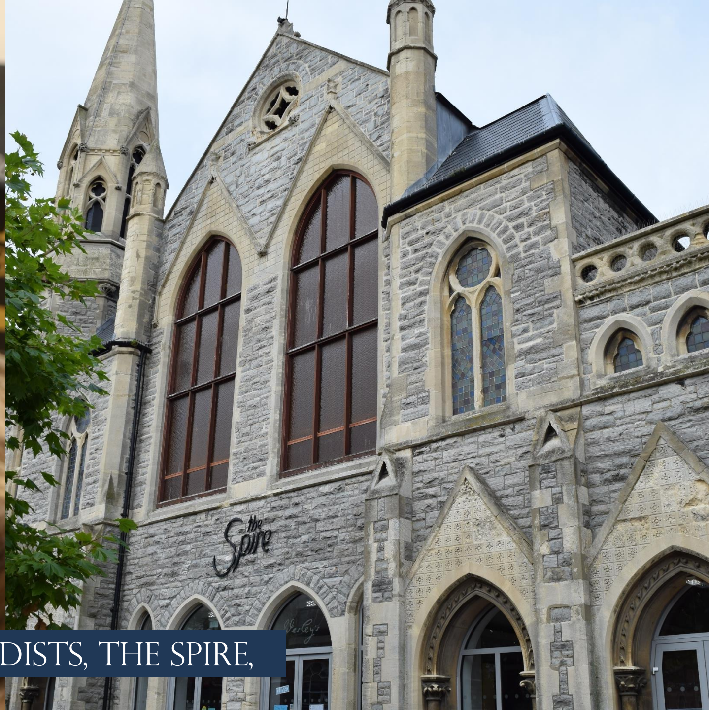
POOLE METHODISTS, THE SPIRE, DORSET