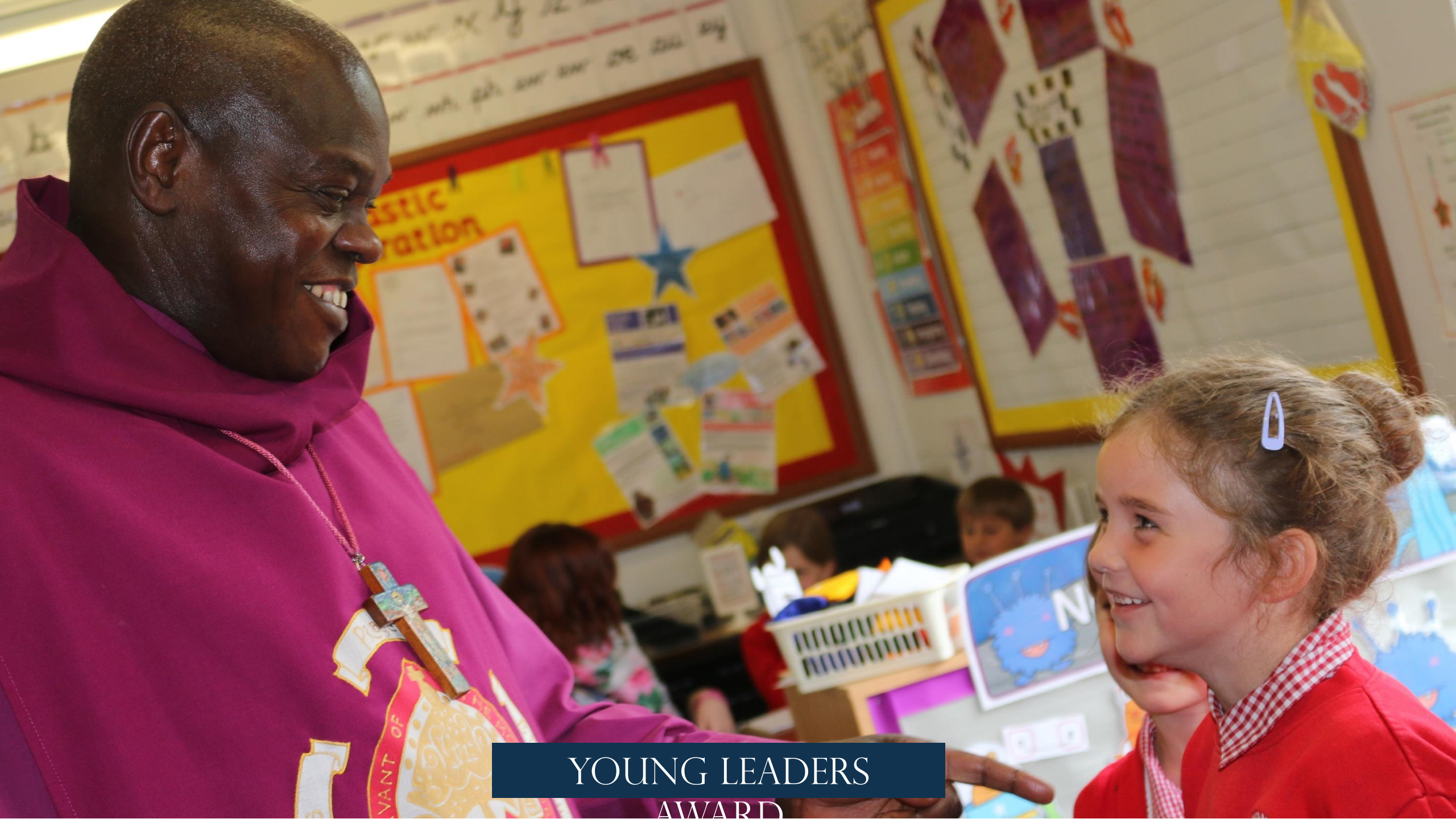
YOUNG LEADERS AWARD