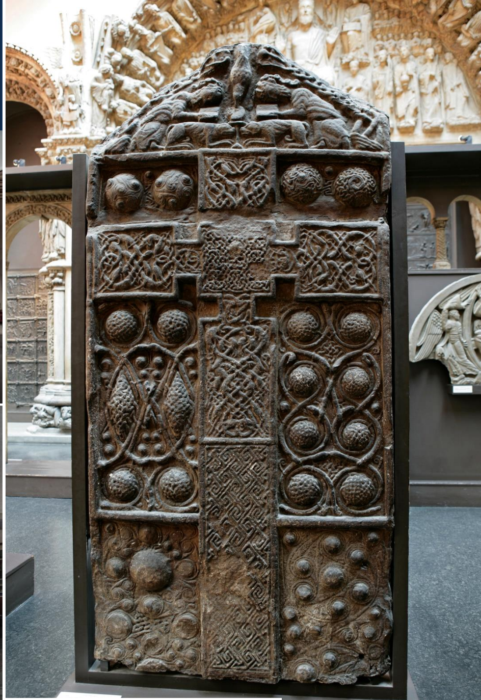
VICTORIA & ALBERT