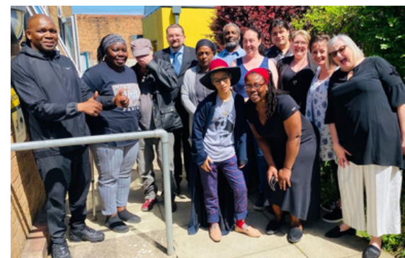
Community Commissioners described being part of the PTC as giving a 'sense of belonging', 'solidarity' and a 'feeling of not being alone'

In 2020 Thrive began hosting the second Poverty Truth Commission, funded by Birmingham City Council through Public Health, to build on the emerging themes of the first PTC, particularly housing. The PTC began with a small group of people experiencing the struggle against poverty (Community Commissioners), coming together with a commitment to see social change using their personal testimonies as the foundation. In the initial stages of the PTC, this group focused on sharing stories, to build and enable relationships and trust to develop.