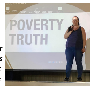
Two of our commissioners taking part in the launch event. It takes courage to be at the front of a room full of people and share your story...