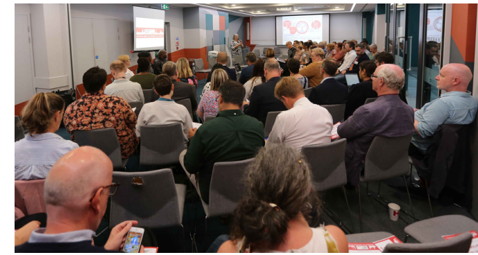
Guests listening to the formal presentations

where key messages and learning from the PTC was displayed as guests were able to share reflections and meet commissioners as they shared refreshment before and after the presentation.