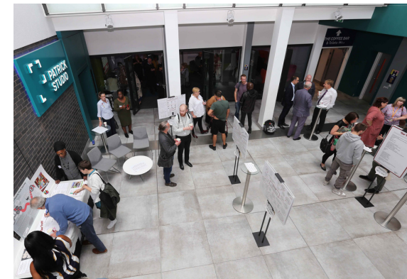
Guests viewing the displays and mingling in the atrium welcome space

“ Some comments from guests who attended the closing event: ”