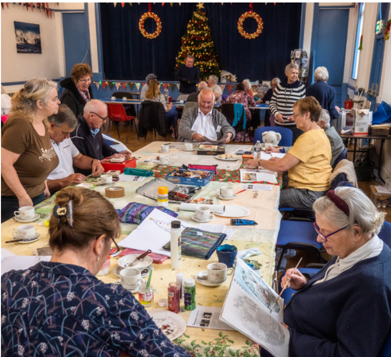
A community wellbeing arts workshop at the Oasis Centre