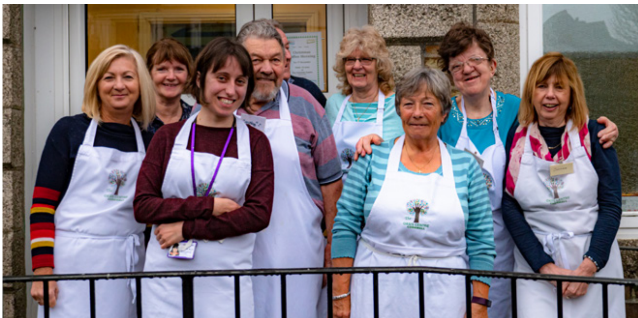
Oasis Centre community café volunteers

'My message to the Church Urban Fund (CUF) – I see the biggest problem of a lack of linking of faith groups. Lots of people of different faiths are coming to Britain but they are not connected. So CUF should do more to connect these groups.'