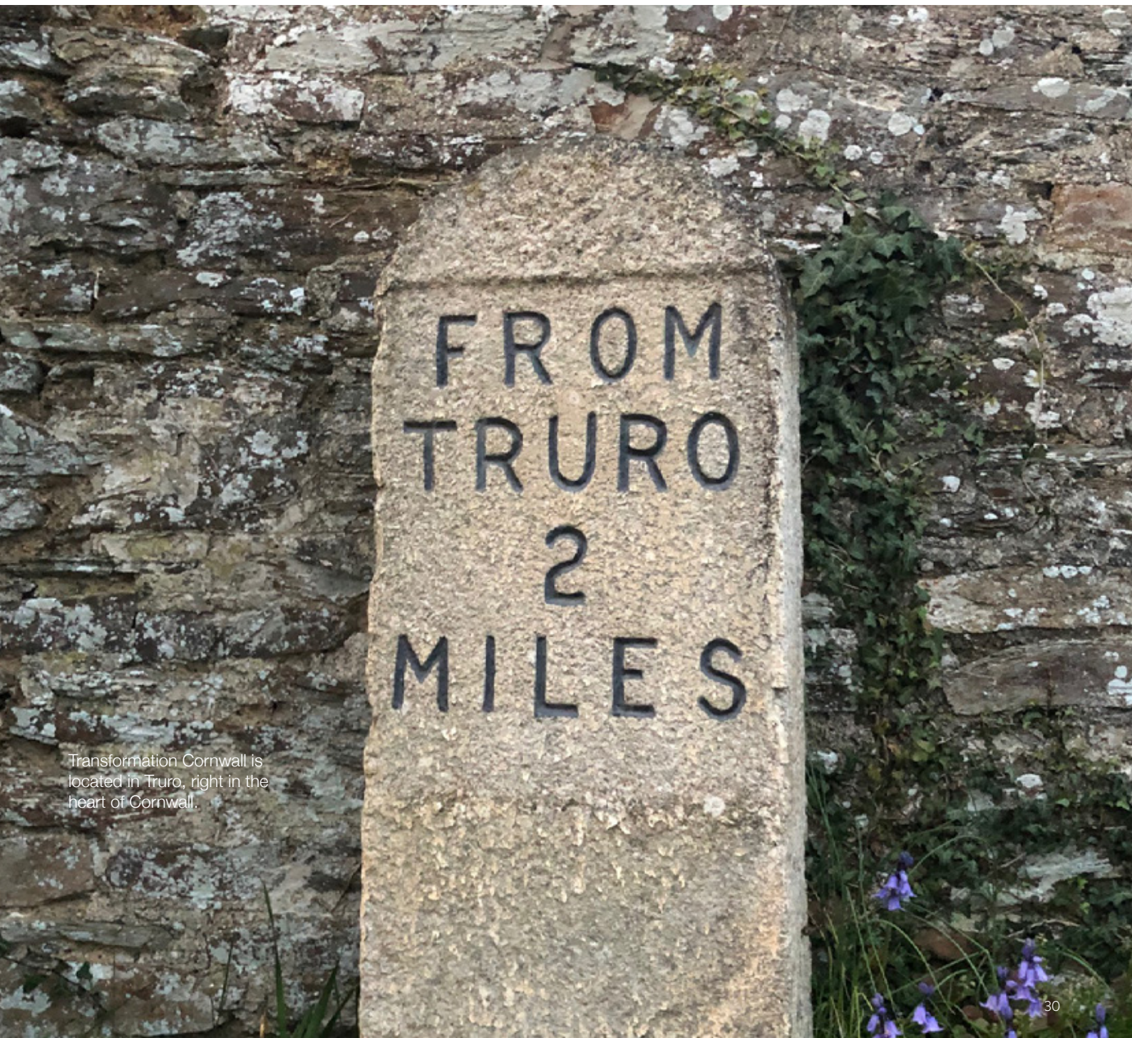
Transformation Cornwall is located in Truro, right in the heart of Cornwall.

'They've been there for us. For example, with funding you feel it's not for faith communities, but they have been able to steer us through what is possible. However, I know Jane is busy so if she had more time there could be even more done.'