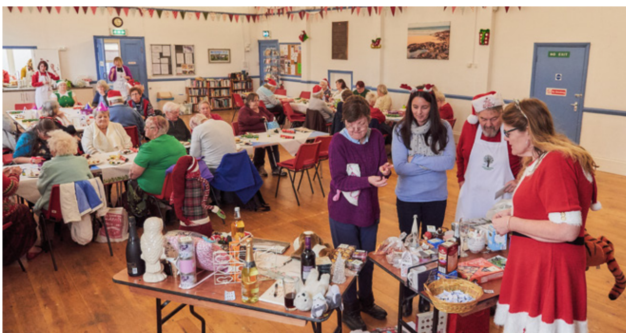
Christmas community event for local people, including those who are isolated, housebound, elderly or disabled at the Oasis Centre