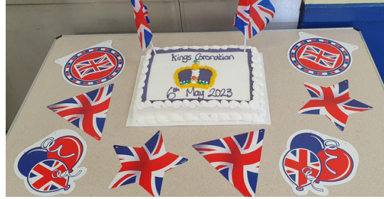
Our lovely cake

Our participants expressed their wish to do something to mark this event and decided to do an old-fashioned party tea - sandwiches, scones, jam, cream and a huge beautifully decorated cake!