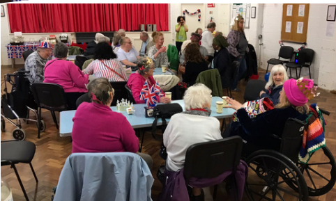
Lovely community atmosphere