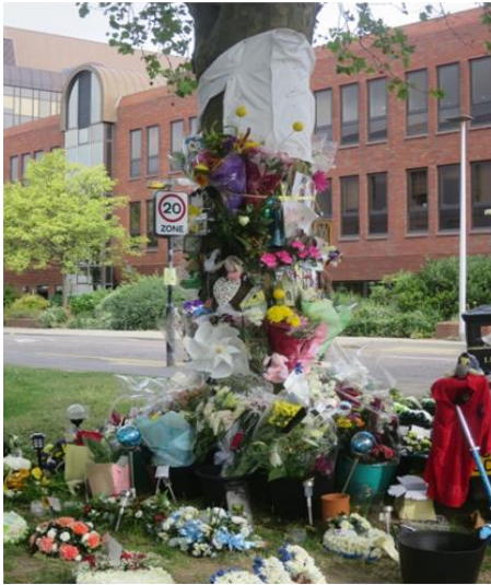
Figure 2: Social Engagement and Mission: 5 Evangelistic Categories

hope and sharing as a bedrock for evangelism and social action.” 13 They also demonstrate the ways through which social action is integral to effective evangelism in contemporary society.