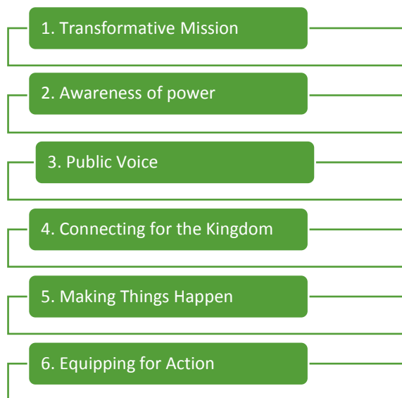
Figure 3: Six Contemporary SR Contributions