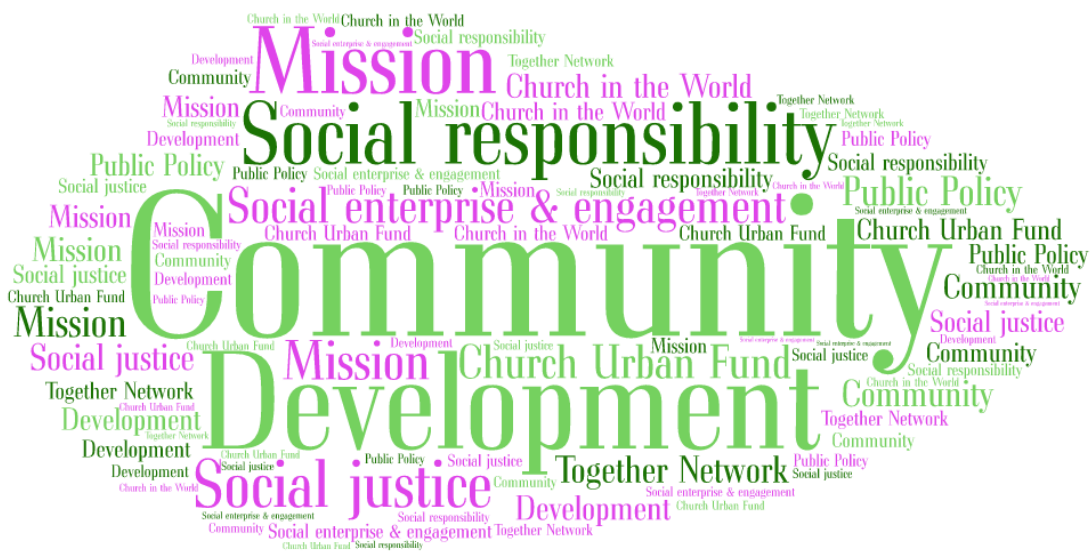
Figure 1: Job Titles – Diocesan Social Responsibility Staff

The assorted job titles of SRN members give a flavour of the current focus and content of the role (Figure 1). SRN members provide infrastructure support for grass-roots community engagement and, as such, are familiar with practical expressions of God's love in parishes across each diocese. Some dioceses also run projects and deliver services which are externally funded. Activities vary greatly from diocese to diocese, reflecting local circumstances, but can be accommodated within eight broad categories: 'community development', 'finance', 'health & well-being', 'social exclusion', 'criminal justice', 'family life', 'environment', and 'global concerns'. 9 Through this knowledge and expertise, they are well placed to provide strategic leadership on matters of social responsibility within dioceses.